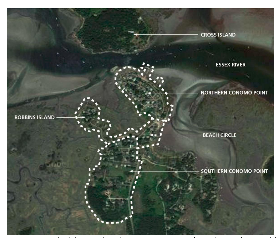
Conomo Point, currently delineated as three main regions: 1) Southern, 2) Central (includes Beach Circle Robbins Island, and 3) Northern. From Brown-Sardina Plan Documents

Conomo Point is a land parcel partially owned by the town of Essex consisting of ~ 130 acres, ~ 40 acres of which are occupied by ~ 120 "cottages", and is currently being described as being comprised of three main sections – North (10 acres), Central (7 acres), and South (23 acres), as depicted in the figure below.