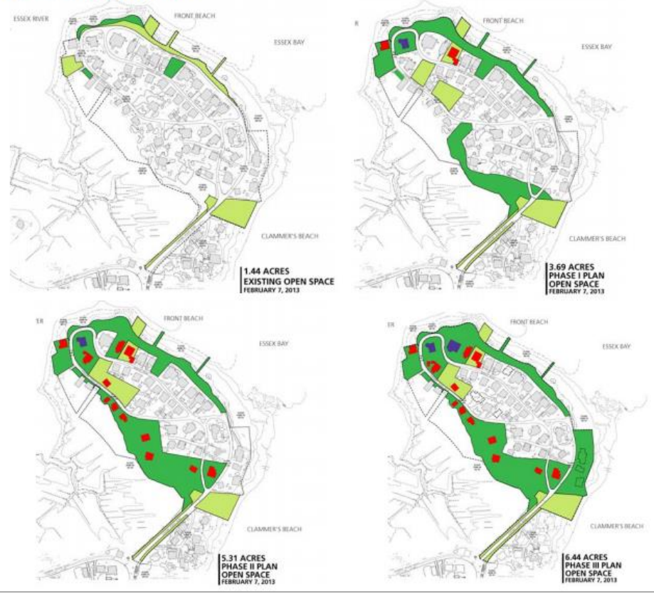
Comparison of Open Space – Current and 3 Phases of Brown-Sardina Plan