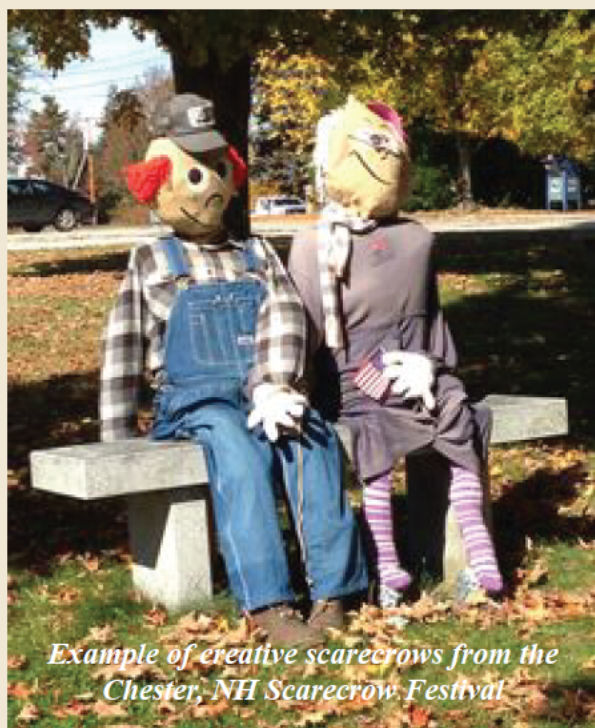
Example of creative scarecrows from the Chester, NH Scarecrow Festival