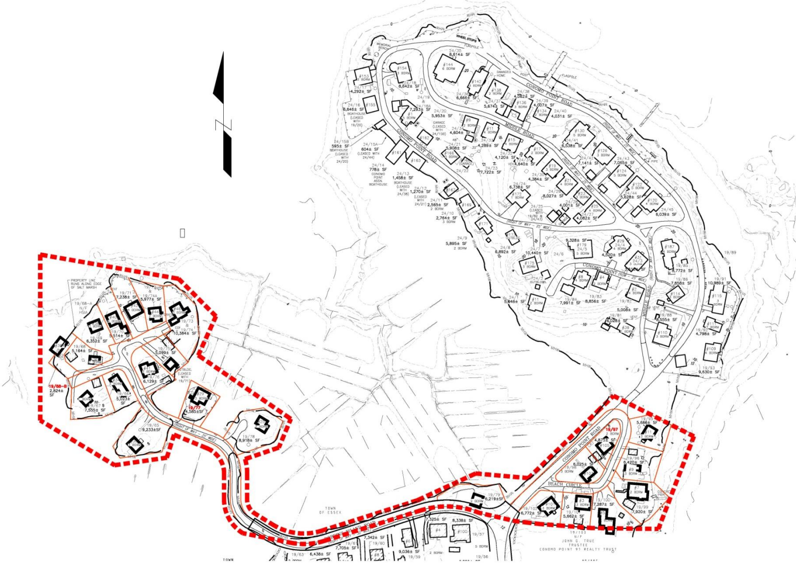
EXHIBIT 1 – ZONING MAP DISTRICT FOR CENTRAL CONOMO POINT